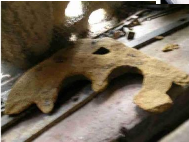
Pieces of the eastern sound window lying by the window.