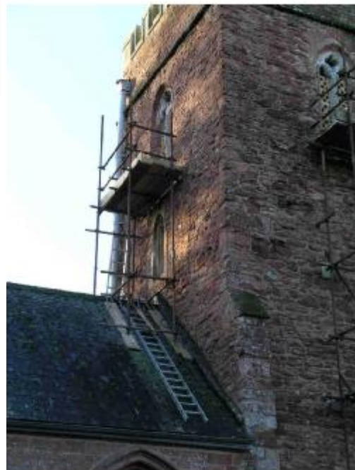
Repairing the eastern and northern sound windows.